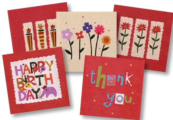
(Examples of cards – designs may differ)

If you would like to order, please send us a cheque made payable to The Sreepur Village plus a note of the cards required and your name and address.